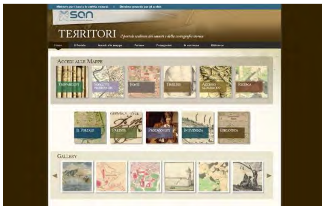
Figure 1: Territori homepage.

The lower part of the homepage contains the “Gallery” a slideshow of images (of the thumbnail) of the best document digital reproductions. Clicking on every image the user can have access to the images visualization system made available by specific DIVENIRE system to which belong the digital reproduction of a document or a map.