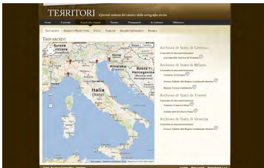
Figure 2: Trovarchivi section of Territori.

heritages. In this way the user has an immediate vision of all the partners that are contributing to the portal with their documentation.