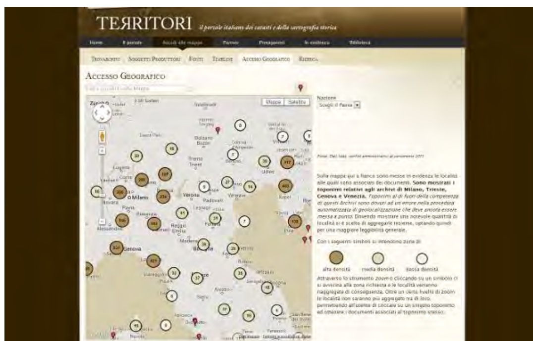
Figure 4: The geographical access in Territori.